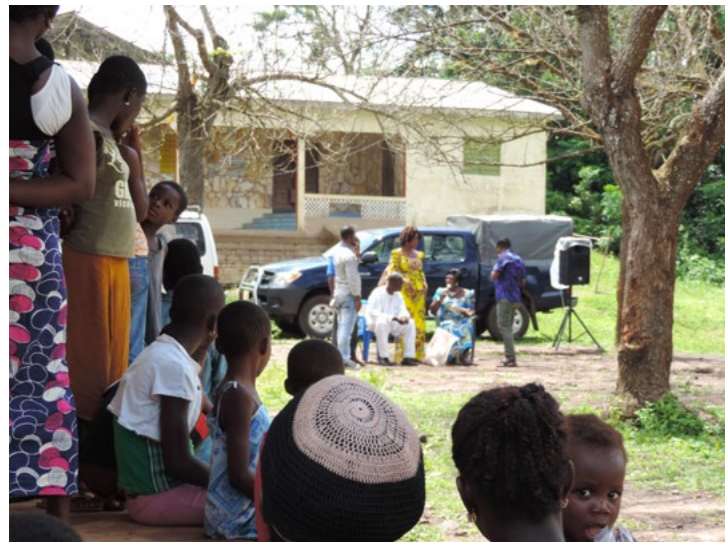
Photos: Educational work with sketches

da, Burundi, Kenya, Togo, Burkina Faso, Zimbabwe, Niger and Sudan. The teams provide local information about the virus, the course of the disease and the risks of infection, for example at bus stops and marketplaces, but also in health institutions and educational establishments. The partners also offer medical aid, social and psychological support to those affected; this often takes place in self-help groups, church organisations and schools. Particularly supported are children who – due to the loss of their parents and family members – are defenceless, in need, and often completely alone.