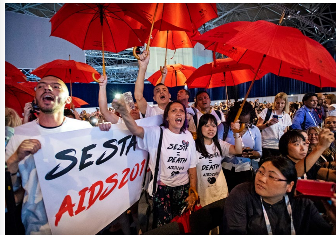
← Protests during former US President Bill Clinton's keynote speech at the 22nd IAC in Amsterdam in 2018