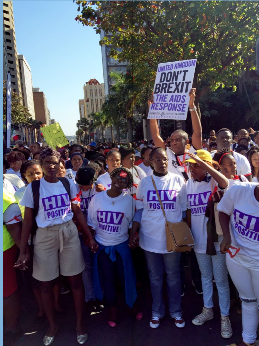
↑ Protest by civil society members during the World Aids Conference in Durban 2016

The data collected by UNAIDS allows other organisations to respond with targeted programmes. To this end, UNAIDS develops and implements standards based on human rights principles and target group orientation, respect for and involvement of communities living with HIV and based on current scientific knowledge. This is particularly important in relation to traditional values and morals as well as the potential for discrimination to which people living with HIV are exposed in numerous places. Many stakeholders like