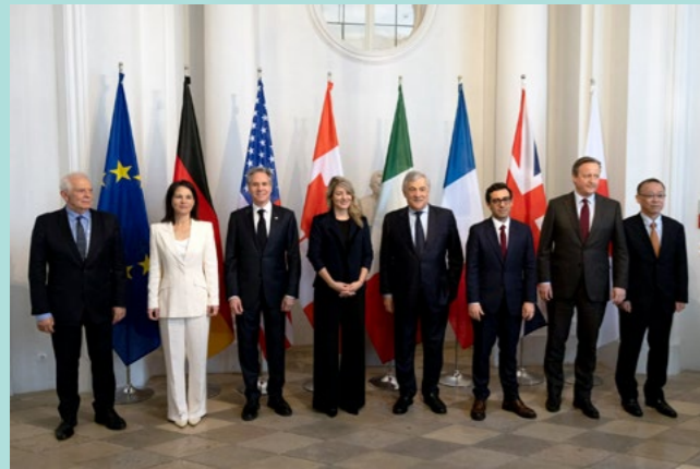
↑ First meeting of G7 foreign ministers under Italian presidency on 17 February 2024 in Munich

For this reason, Action against AIDS Germany deliberately decided to address the informal G7 and G20 dialogue formats in addition to the United Nations because potentially, positive signals can be sent here. The heads of government in both formats are usually in favour of supporting the Global Fund. This momentum must be encouraged and demanded by civil society. ●