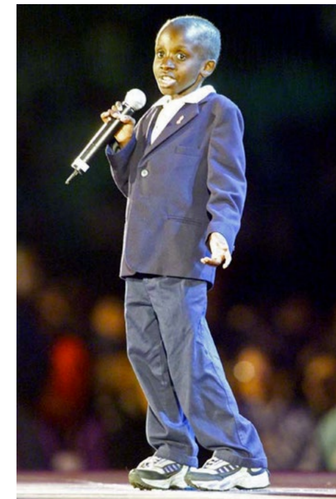
↑ Nkosi Johnson at the opening of the 13th International Aids Conference in Durban, South Africa on July 9, 2000

Things turned out differently for Nkosi Johnson. Health is a human right and a political and financial decision. The fact that deniers can stand in the way of this right is part of HIV-history. Something similar was repeated during the COVID-19 pandemic. ●