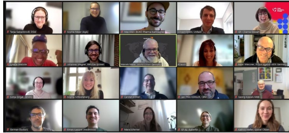
→ Participants of the fireside chat on November 23, 2023

The synergy and the importance of understanding and considering the intersectionality of both crises and therefore tackling them together was the core of the discussion and was emphasised and illustrated by all panellists.